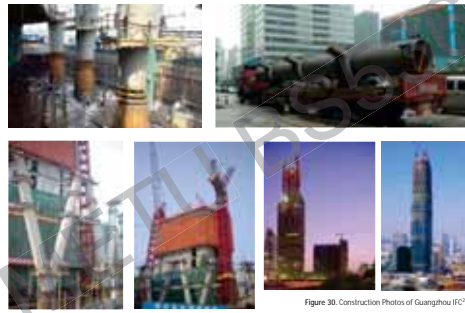
Figure 30. Construction Photos of Guangzhou IFC [23]